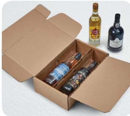
KS-RP-07 Regular and KS-RP-07 Box 2