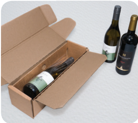
KS-RP-07 Regular and KS-RP-07 Box 1