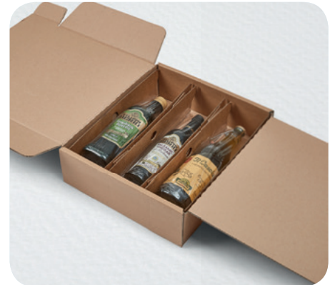
KS-RP-07 Regular and KS-RP-07 Box 3