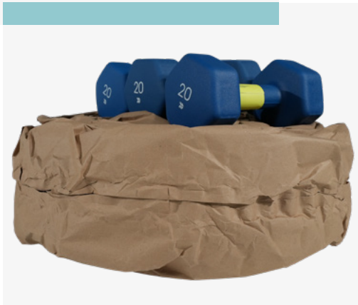
ProPad Coiler cushioning supporting 1.4 - 9.1 kg weights