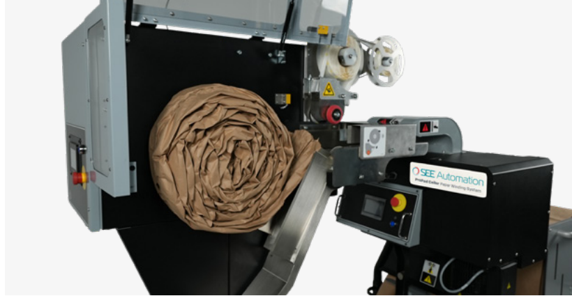
Close-up ProPad Coiler