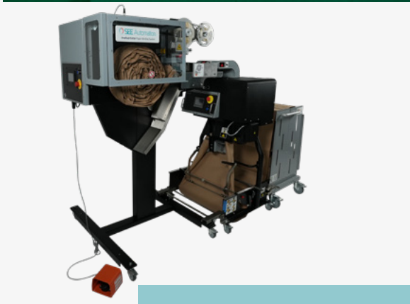
ProPad Coiler winding system